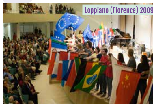
Loppiano (Florence) 2009

Each year, on May 9, we celebrate the Europe Day. On this occasion we organize prayer meetings and other events of various types in many cities. These events are meant to contribute toward a reconciled Together and to promote the motto of the European Union, 'Unity in diversity'.